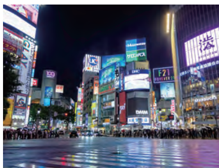
Shibuya scramble crossing

HANDPICKED QUALITY BEEF IN ORDER TO BRING OUT THE BEST OF THE ORIGINAL UMAMI TASTE OF THE BEEF, KURO BEKO ONLY USES CAREFULLY SELECTED PARTS OF THE MEAT.