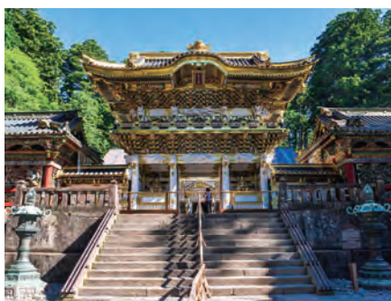
Nikko Toshogu Shrine

THE DELICIOUS SPECIAL KAGURA PORK CUTLET SERVED AT J'S KITCHEN IS COMING TO ALL OF THE UNITED STATES.