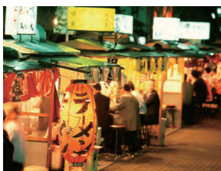
Fukuoka Nakasu stalls

DELICIOUS MELTY & JUICY HAMBURG, 100% PURE JAPANESE BLACK BEEF AND THE TASTE OF FUKUYOSHI.